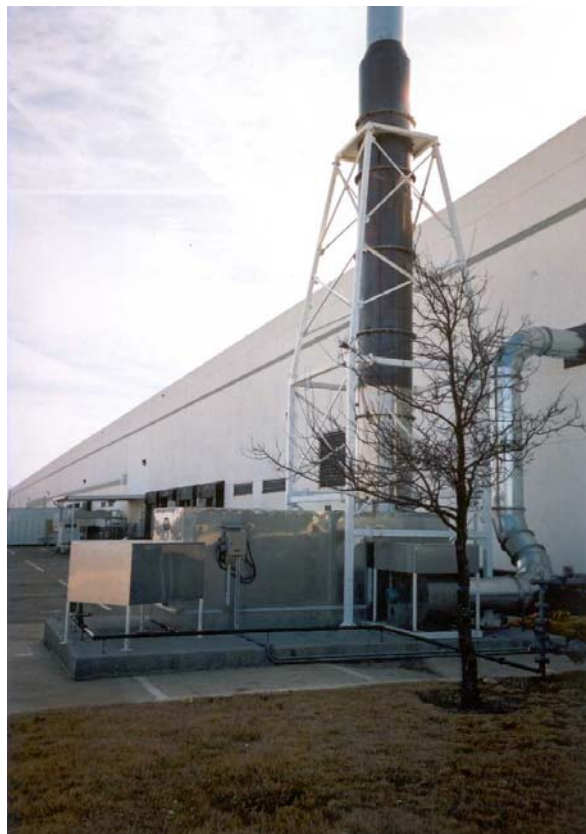
Custom Engineered Recuperative Thermal Oxidizer

4 Cyte/Triple S SPIDA Paint Process Facility Fort Worth, TX, USA